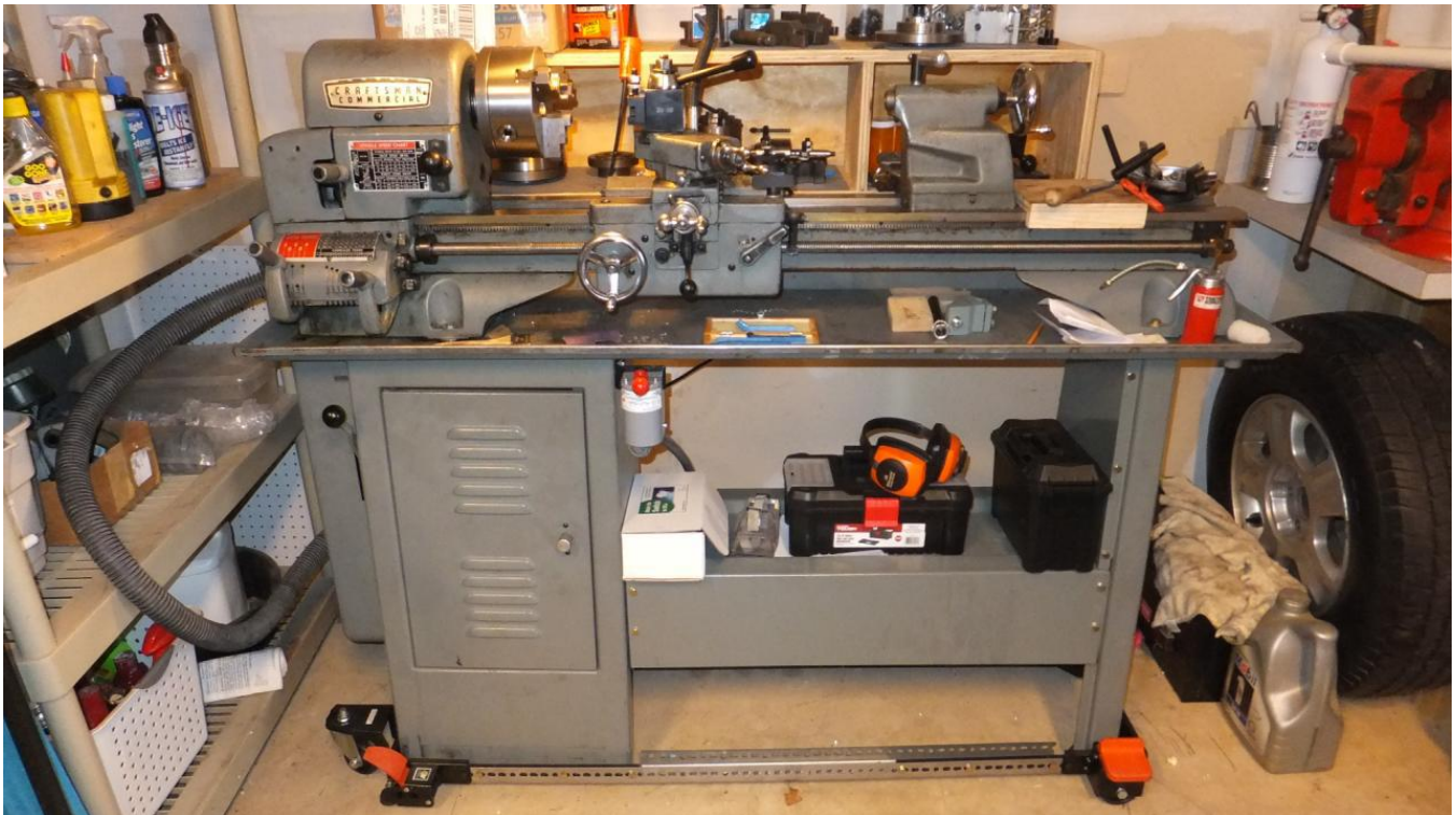
This photo is of my refurbished 12-inch Craftsman lathe mounted on a mobile base in my garage.

I am so glad I found the Home Metal Shop Club's website. It is a valuable resource. I especially like the members' hints. I can't thank you enough.